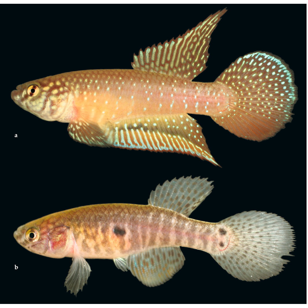
Fig. 3. Live individuals of Nematolebias catimbau , Brazil: Rio de Janeiro: Sampaio Correia. a , UFRJ 8888, holotype, male, 45.7 mm SL; b , UFRJ 8889, paratype, female, 33.6 mm SL.

(C>T), cytb.374(A>G), and from N. whitei by the latter having the following four UNS: cox1.336 (A>G), cox1.387(C>T), cox1.643(T>C), cytb.218 (T>C).