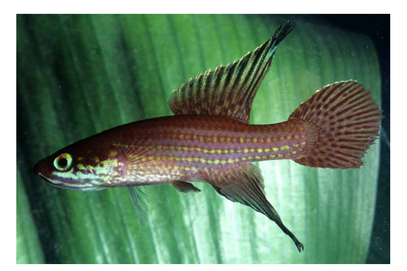
FIGURE 7. Campellolebias chrysolineatus, UFRJ 5210, male, 30.1 mm SL; Brazil: Santa Catarina: Araquari.