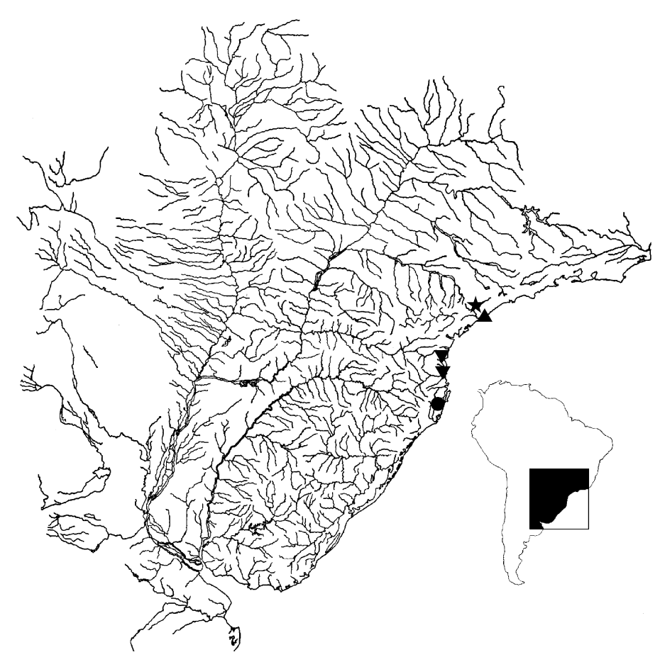
FIGURE 4. Geographic distribution of the genus Campellolebias . Triangles = C. dorsimaculatus ; stars = C. intermedius ; inverted triangles = C. chrysolineatus ; dot = C. brucei . Some symbols may represent more than one locality.