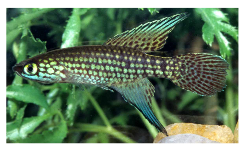
FIGURE 9. Campellolebias brucei, UFRJ 4493, male, 26.9 mm SL; Brazil: Santa Catarina: Criciúma.

base of 3^{rd} or 4^{th} anal-fin rays in males, reaching base of 1st or 2nd anal-fin ray in females. Pelvic-fin bases medially separated by interspace slightly shorter than pelvic-fin base. Dorsal-fin origin anterior to anal-fin origin, anal-fin origin on vertical between base of 2nd and 3rd dorsal-fin rays in males, between base of 3rd and 4th dorsal-fin rays in females. Dorsal-fin origin between neural spines of vertebrae 9 and 11. Anal-fin origin between pleural ribs of vertebrae 10 and 11 in males, between pleural ribs of vertebrae 11 and 12 in females. Dorsal-fin rays 16–19; anal-fin rays 2 + 14–16 in males, 16–18 in females; caudal-fin rays 26–30; pectoral-fin rays 13–14; pelvic-fin rays 5–6.