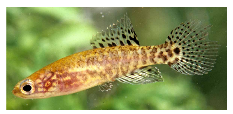
FIGURE 3. Campellolebias dorsimaculatus , UFRJ 6309, female, 22.0 mm SL; Brazil: São Paulo: Iguape.

Dorsal and anal fins pointed, moderately elongate in males, tip reaching vertical through caudal-fin base; dorsal and anal fins rounded, short and without filamentous rays in females. Caudal fin rounded. Pectoral fins elliptical. Posterior margin of pectoral fins reaching vertical between pelvic-fin base and anus in males, through vertical just in front pelvic-fin base in females. Tip of pelvic fins reaching anterior portion of pseudogonopodium base in males, reaching urogenital papilla in females. Pelvic-fin bases medially in contact. Dorsal-fin origin anterior to anal-fin origin, anal-fin origin on vertical between base of 2nd and 3rd dorsal-fin rays in males, between base of 3rd and 5th dorsal-fin rays in females. Dorsal-fin origin between neural spines of vertebrae 9 and 11. Anal-fin origin between pleural ribs of vertebrae 10 and 11 in males, between pleural ribs of vertebrae 11 and 12 in females. Dorsal-fin rays 16–18; anal-fin rays 2 + 13–15 in male, 15–16 in females; caudal-fin rays 26–30; pectoral-fin rays 13–14; pelvic-fin rays 5–6.