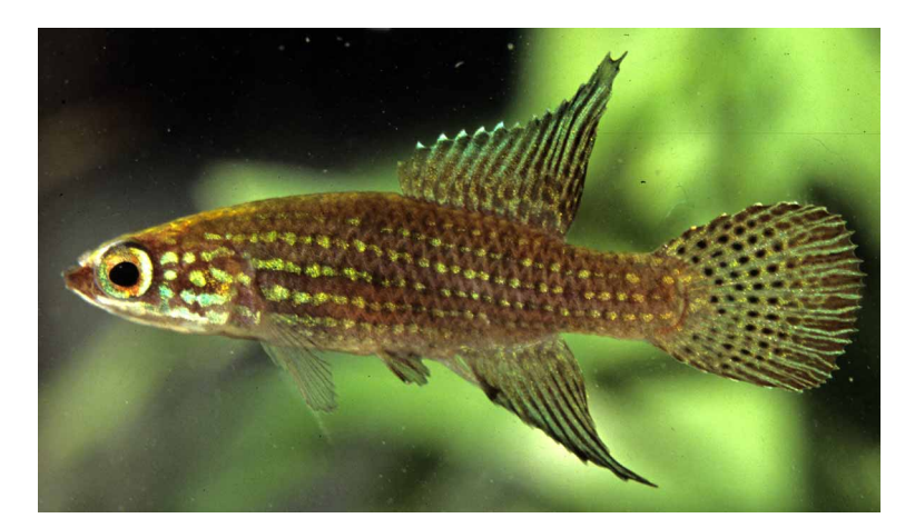
FIGURE 5. Campellolebias intermedius , UFRJ 6312, holotype, male, 23.9 mm SL; Brazil: São Paulo: Juquiá.