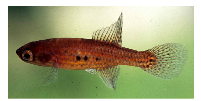
FIGURE 8. Campellolebias chrysolineatus, UFRJ 5210, female, 23.3 mm SL; Brazil: Santa Catarina: Araquari.

Dorsal and anal fins pointed and elongate in males, terminating in short filament reaching vertical through posterior half of caudal fin; dorsal and anal fins rounded, short and without filamentous rays in females. Caudal fin rounded. Pectoral fins elliptical. Posterior margin of pectoral fins reaching vertical between pelvic-fin base and anus. Tip of pelvic fins reaching base of 3rd or 4th anal-fin rays in male, reaching between base of 1st and 3rd anal-fins ray in females. Pelvic-fin bases medially separated by interspace about half pelvic-fin base width. Dorsal-fin origin anterior to anal-fin origin, anal-fin origin on