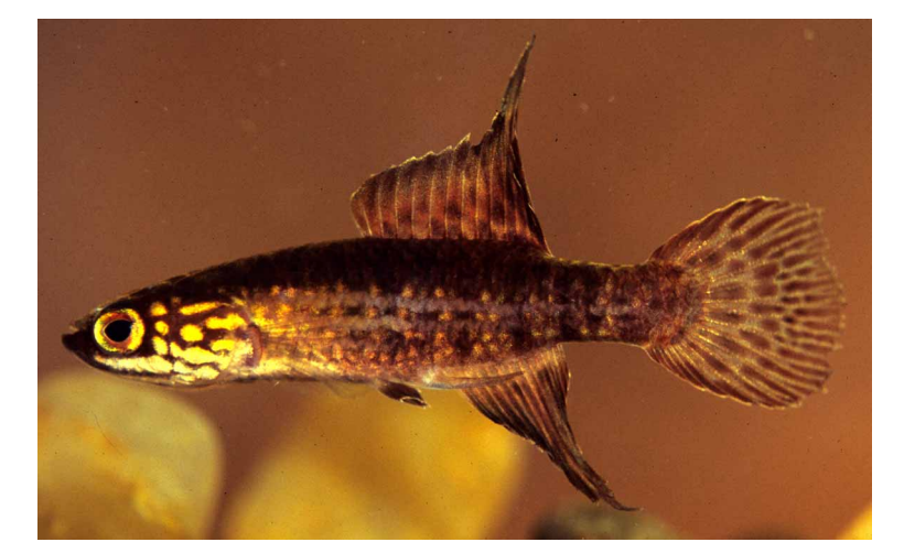
FIGURE 2. Campellolebias dorsimaculatus , UFRJ 6311, male, 26.1 mm SL (one day after collection); Brazil: São Paulo: Iguape.