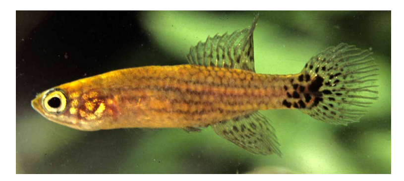
FIGURE 6. Campellolebias intermedius , UFRJ 6313, paratype, female, 20.7 mm SL; Brazil: São Paulo: Juquiá.

Dorsal and anal fins pointed, slightly elongated, tip reaching vertical through basal portion of caudal fin in males, rounded and short in females. Caudal fin rounded. Pectoral fins elliptical. Posterior margin of pectoral fins reaching vertical between pelvic-fin base and anus in males, through vertical just in front pelvic-fin base in females. Tip of pelvic fins reaching anterior base of pseudogonopodial rays in males, reaching urogenital papilla in females. Pelvic-fin bases medially separated by interspace, with length equal to half pelvic-fin base width. Dorsal-fin origin anterior to anal-fin origin, anal-fin origin on vertical between base of 3rd dorsal-fin ray. Dorsal-fin origin between neural spines of vertebrae 11 and 12 in males, 9 and 10 in females. Anal-fin origin between pleural ribs of vertebrae 11 and 12 in males, between pleural ribs of vertebrae 11 and 12 in females. Dorsal-fin rays 2+13–14 in males, 14–16 in females; caudal-fin rays 25–27; pectoral-fin rays 14; pelvic-fin rays 6.