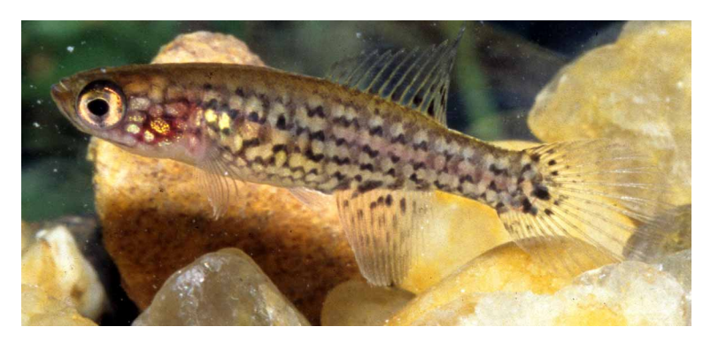
FIGURE 10. Campellolebias brucei, UFRJ 4493, female, 18.0 mm SL; Brazil: Santa Catarina: Criciúma.

Scales large, cycloid. Body and head entirely scaled, except on anteroventral surface of head. Dorsal and anal-fin bases without scales. Scales covering anterior 10 % of caudal fin. Frontal squamation E-patterned, E-scales not overlapped. Longitudinal series of scales 25–26; transverse series of scales 7–8; scale rows around caudal peduncle 12. Three to six minute contact organs on exposed margin of each scale of ventral portion of flank in