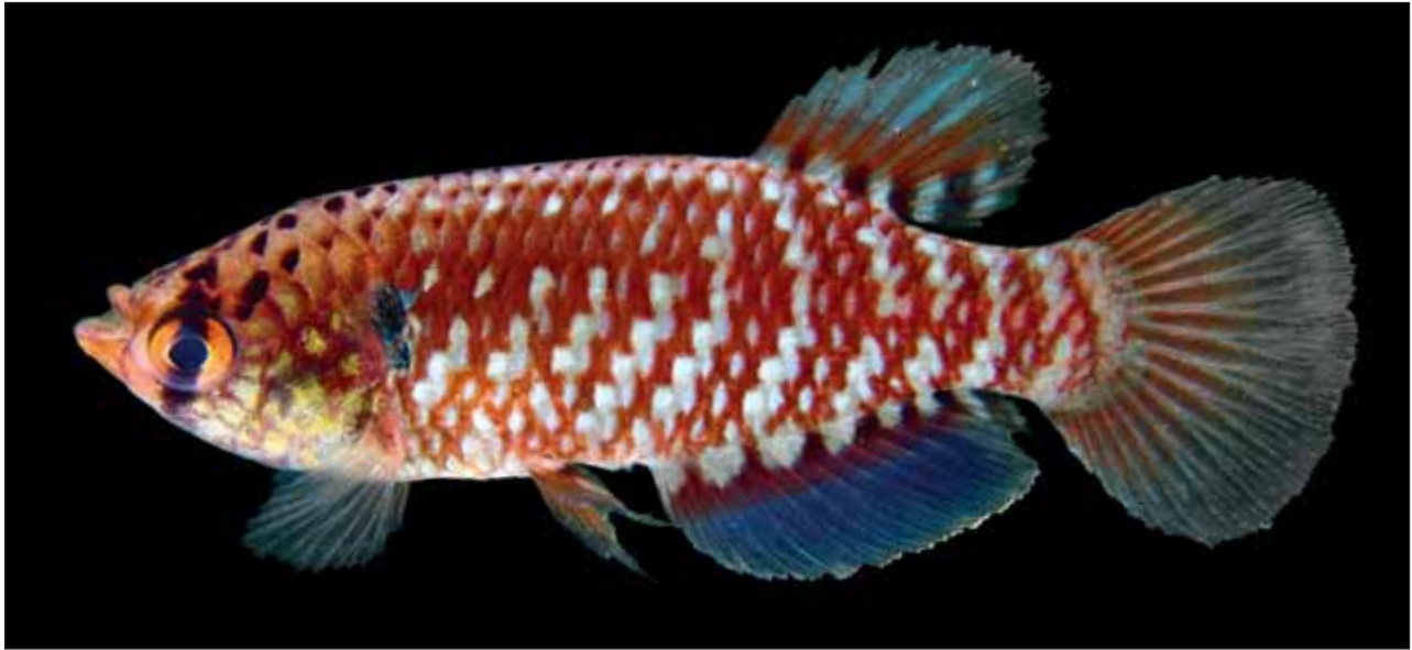
Fig. 1. Papiliolebias ashleyae , male, holotype, 34.7 mm SL: Bolivia, San José dos Chiquitos (in life).

Description: Morphometric and meristic data presented in Table I. Largest specimen examined 36.0 mm SL for males and 29.0 mm SL for females. Males larger than females. Body relatively deep, compressed, greatest body depth at level of pelvic-fin base. Snout blunt. Dorsal profile convex