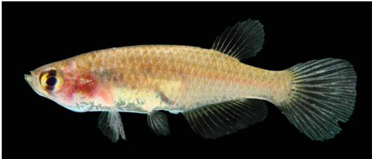
Fig. 2. Papiliolebias ashleyae , female, paratype, 29.0 mm SL: Bolivia, San José dos Chiquitos (in life).