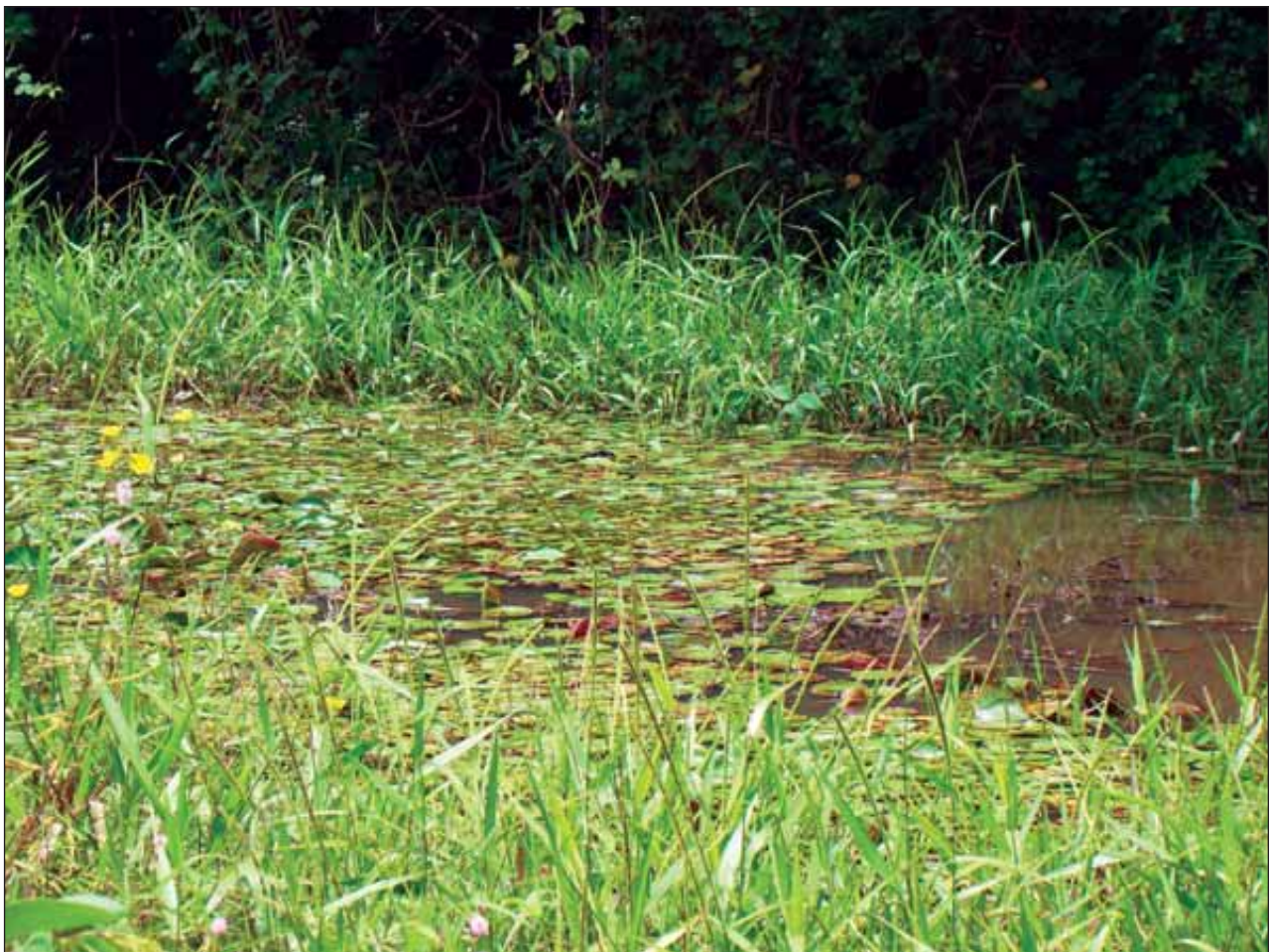
Fig. 4. Type locality of Papiliolebias ashleyae : río San Pablo, upper Mamoré basin, Bolivia.

Papiliolebias was diagnosed by Costa (1998b) by the following four synapomorphies: nine pelvic-fin rays; unpaired fins dark blue; presence of white stripe along the distal margin of anal-fin and a humeral metallic green spot. Nine fin rays are present exclusively in P. bitteri ; P. hatinne and P. ashleyae possess 7-8 rays, a feature considered plesiomorphic by Costa (1998a, b). The unpaired fins dark blue are only present in P. bitteri , as these fins are simply bluish in P. hatinne and blue in P. ashleyae . Therefore, nine pelvic-fin rays, and